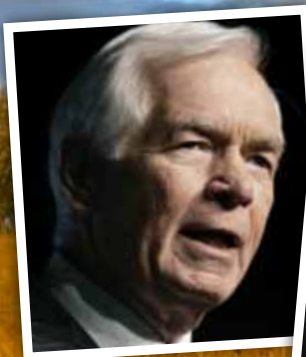
SENATOR THAD COCHRAN MEMBER SINCE 1972