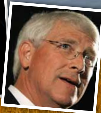
SENATOR ROGER WICKER MEMBER SINCE 1973